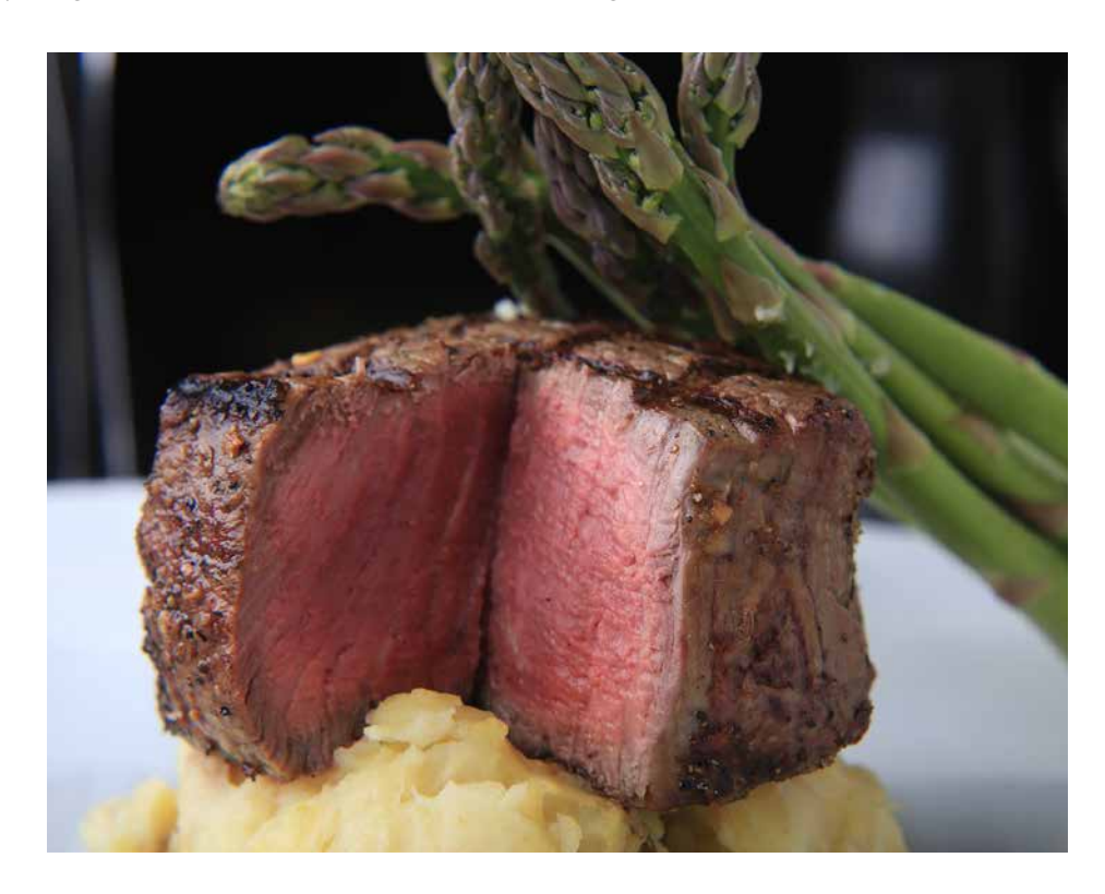
TABLE OF CONTENTS • AMENITIES • SPACES • WEDDING PACKAGES • HORS D'OEUVRES • DINNER • BEVERAGES