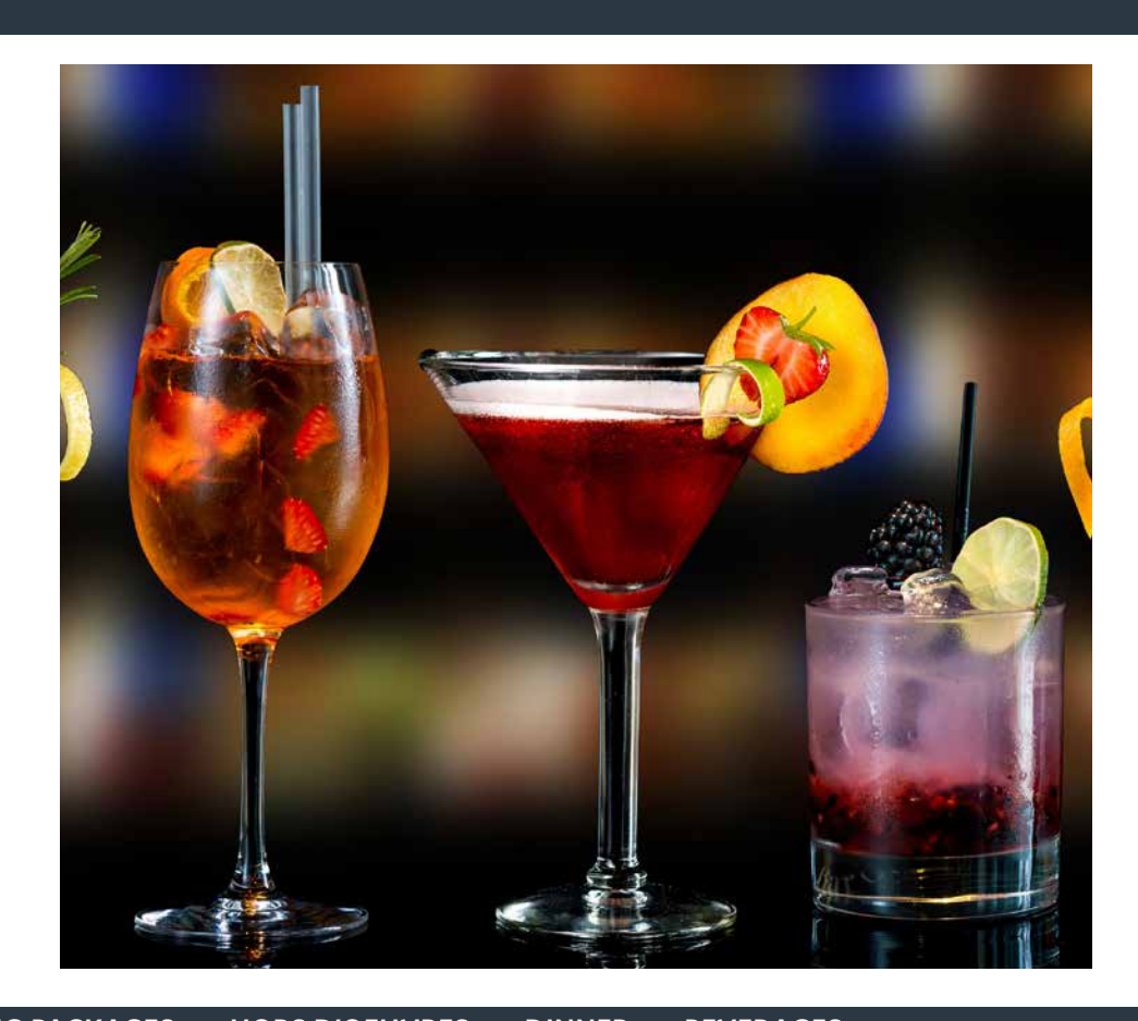
TABLE OF CONTENTS • AMENITIES • SPACES • WEDDING PACKAGES • HORS D'OEUVRES • DINNER • BEVERAGES

Please note that most special requests can be accommodated with advance notice. Don't hesitate to ask about specialty beer, wine or liquor.